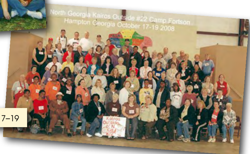
Kairos Outside North #22 — Oct 17–19