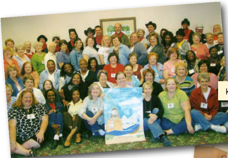
Kairos Outside South #5 — Sept. 26–28

To achieve any and all of the above we need to pray, listen, listen, love, love and pray. Merry Christmas to all and may God continue to bless you and your family.