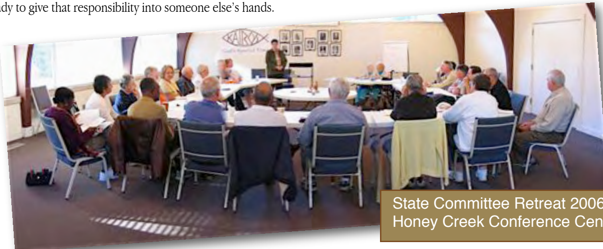
State Committee Retreat 2006, Honey Creek Conference Center