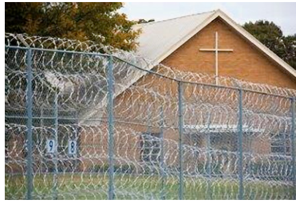
Lee Arrendale Chapel

I felt deep in my heart and soul that my life would change, but I was not prepared for the extent of the change. To say that I will never be the same is a true and definite understatement. God pruned me of my fear of Leadership and its corresponding Responsibilities. He gave me boldness to speak His Words of Obedience, Humility, and Servanthood. He corrected me when it seemed