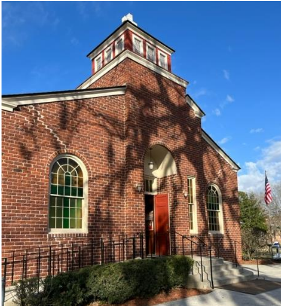
Corpus Christi Catholic Church, Pooler, GA

Ask your church, friends, and family to pray for your Kairos Event.