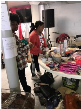
Fundraiser Benefit Sale